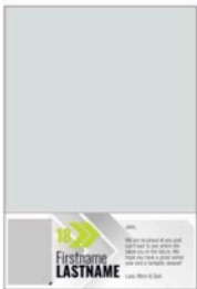
SMALL 5.5 X 2