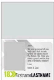
MEDIUM 5.5 X 4.25